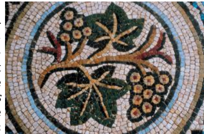
Mosaics of wine production in Séviac in Montréal du Gers.

While Armagnac remains Gascony's best-known export, nearly two thirds of the surface area of the region, 13,000 hectares, is dedicated to the production of Côtes de Gascogne wines. Biscaye Baie, named after the neighboring Atlantic bay, hails from the commune of Vic Fezenac, 25km southwest of Eauze, in the heart of Gascony. Biscaye Baie reflects the region's individual personality through an alliance between the freshness and aromatic expression of Sauvignon Blanc from the area.