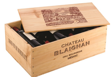
Packed in Wood Cases