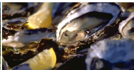
Oysters from the Thau Lagoon