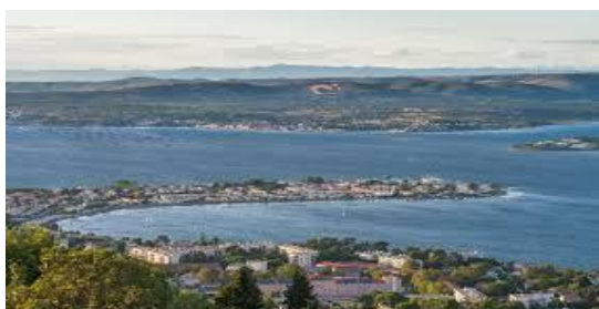
View of the Thau Bassin from the vineyards