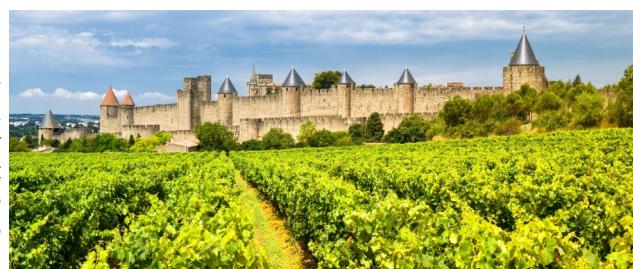
View from the vineyards of the City of Carcassonne

Situated between the Pyrenees to the south and the Black Mountains to the north, Carcassonne enjoys a privileged climatic position where the excesses of the Mediterranean climate are tempered by the softness of the Atlantic. This results in sunny, hot, dry days, but very cool nights. This extraordinary harmony in nature gives the Laroque wines a unique signature: "the aromatic elegance of the 'grand crus' of Burgundy with the price point and strength of Mediterranean wines."