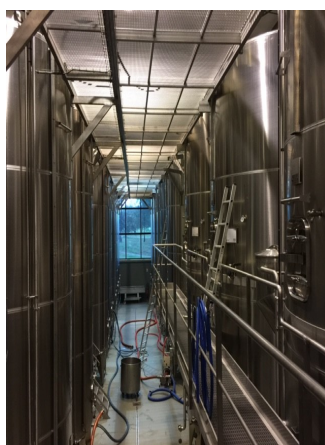
Stainless steel tanks