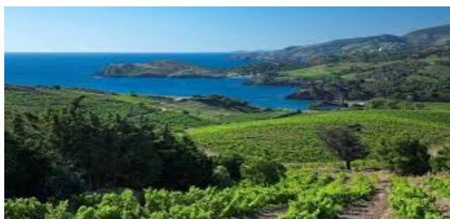
View of the Thau Bassin from the vineyards

Luscious, aromatic nose of raspberries and strawberries. Fresh in the mouth with a well-balanced, full and lively middle palate, and a spicy, lingering finish. Serve VillaViva chilled. Drink anytime as an aperitif or with seafood, poultry, grilled meats, barbecue and Mediterranean-style cuisine.